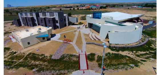
Shiprock, New Mexico Branch Campus