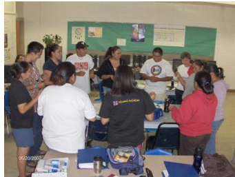
"I'm very thankful to be given this opportunity. Public Health research is a new topic for me. I love it and want to do more." Participant 2007