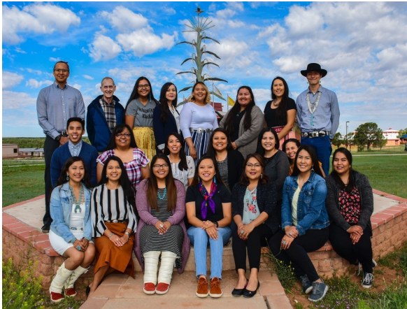
2019 SREP Students, Faculty & Staff

At the conclusion of the program, the students and staff will work on analysis of data and presentation of their experiences in public health and health research virtually.