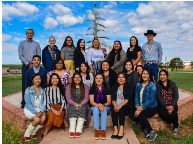
2019 Summer Research Enhancement Program Students, Staff and Faculty

If you are an American Indian College Student and have an interest in public health and health research among Native Americans, this opportunity may be for you.