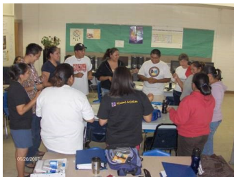
"I'm very thankful to be given this opportunity. Public Health research is a new topic for me. I love it and want to do more." Participant 2007