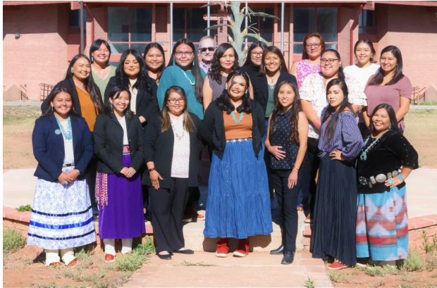
2022 SREP Students, Faculty & Staff

At the conclusion of the program, the students and staff will work on analysis of data and presentation of their experiences in public health and health research.