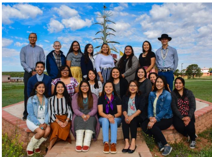
2019 Summer Research Enhancement Program Students, Staff and Faculty

If you are an American Indian College Student and have an interest in public health and health research among Native Americans, this opportunity may be for you.