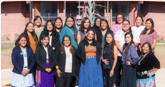
2022 SREP Students, Faculty, & Staff