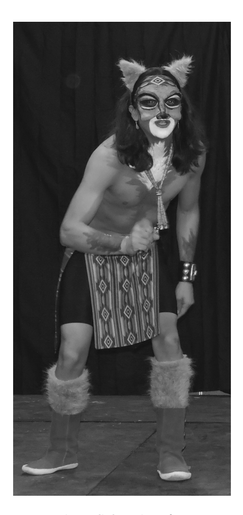
AIHEC One Act Play

The course will incorporate fundamental techniques of acting and storytelling through physical and vocal expression, improvisation, and monologue scene work, with an emphasis on characterizations and performance. A class performance of a dramatic production will be the course culmination.